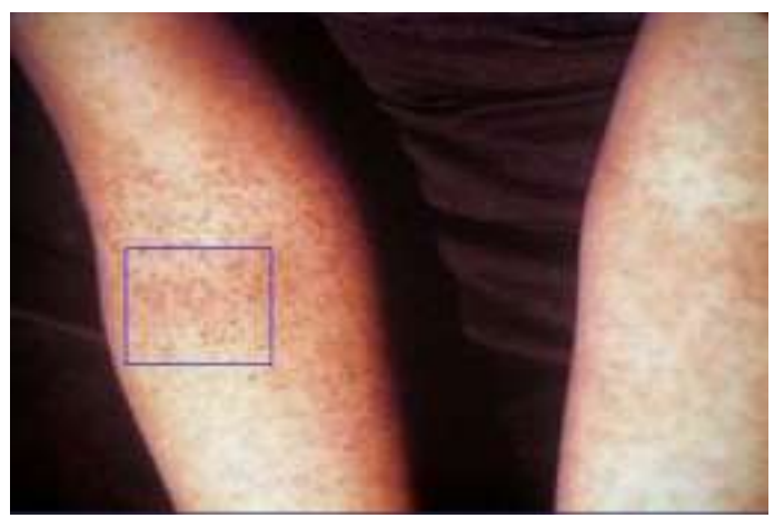
FigureN4:"positive"tourniquet"test" showing">20"petechiae"in"2.5cm" square"on"the"skin"surface"of" forearm.