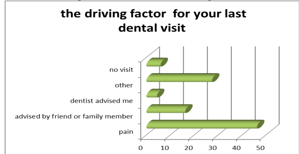
Figure number (1) last dental visit driving factor