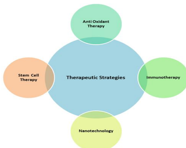
Fig 2: Therapeutic Strategies employed to treat Neurodegenerative Disorders.