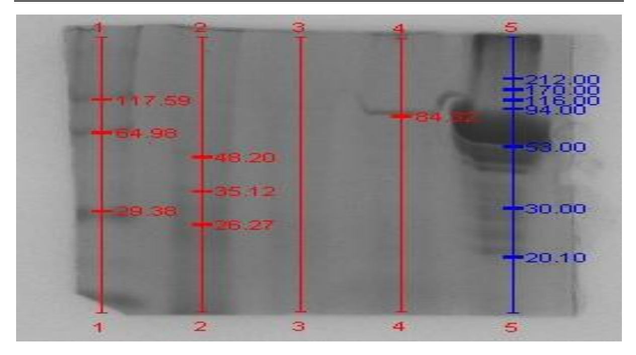
Fig 2: SDS-PAGE analysis (with computed Mol. Wt. of the proteins with reference to the virtual standard analyzed on Bio-Rad Quantity One Software) of the larvae treated with different concentrations of CF. Lane 1-30%; Lane 2 – 20%; Lane 3- 10%; Lane 4- Control; and Lane 5 – Molecular marker