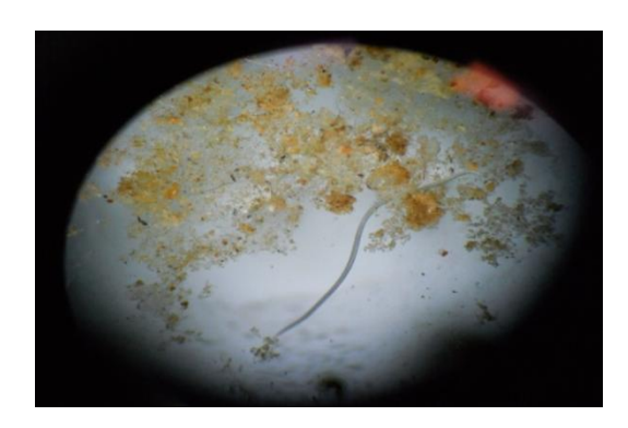
Fig. 1: Root knot nematodes

Most vegetable crops are attacked by one or more species of nematodes. The root-knot nematode ( Meloidogyne javanica )(fig. 1) is the most important species associated with tomato ( Lycopersicon esculentum )[4]. This phytonematode species causes chlorosis, premature leaf drop and stunting. The disease is becoming one of the most serious calamities for the successful cultivation of tomato crop. These nematodes cause up to 70-90% yield losses in tomatoes and brinjal. In India, yield loss of tomato due to root-knot nematodes ( Meloidogyne spp.) ranges from 39.7% to 46.0%. The present investigation was made to study the nematicidal activity of newly synthesized thiazole Schiff bases (SB-1 to SB-3) on M. javanica .