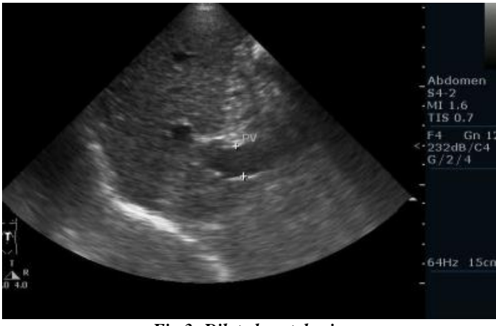
Fig.3 :Dilated portal vein